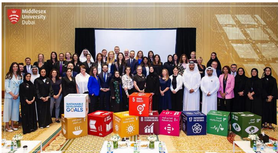
MDX Dubai presents at the FCSA consultation to the Private Sector Council on Goal 5 Gender Equality

Additionally, the Middlesex University Dubai Wellness Office has been established to foster a positive learning environment for students and a supportive working environment for staff. The Wellness Office undertakes and supports wellness initiatives in four key areas: Integrated wellness curriculum, mdxMindset webpage, Research, Collaboration and Outreach. These measures aim to increase awareness and build coping mechanisms outside formal psychological intervention; provide staff and students with a greater sense of control in order to improve focus, retention, satisfaction, achievement, and overall wellbeing; build community resilience to deal adverse events in order to minimise dependence on external organisations; and mitigate the effects of the global crisis on staff and students within the organisation.